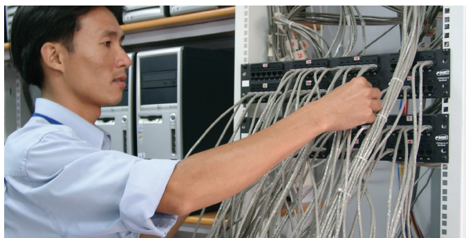
NTS uses the latest technology to verify the compatibility, functionality and compliance of your products