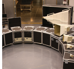
NTS has numerous facilities capable of conducting your HIRF testing across the country