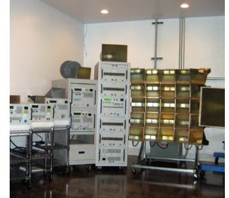
Our technicians will find any susceptibility in your system

NTS employs a variety of tools and techniques to produce accurate testing that is fully compliant with all required specifications.