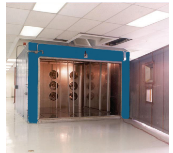
Thermal Cycling Chamber