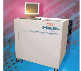
The HATS System can test 36 coupons for a total of 144 daisy chain test nets per run

HATS™ testing requires a HATS™ tester. HATS™ testers can test 36 (4 net) coupons for a total of 144 daisy chain test nets per test run. Doing 1000 cycles of that many coupons/nets with other technologies can take weeks if not months due to their limited capacity. The HATS™ tester does 1000 cycles of 36 coupons/144 nets in less than a week. Carefully research the methodologies out there before you decide.