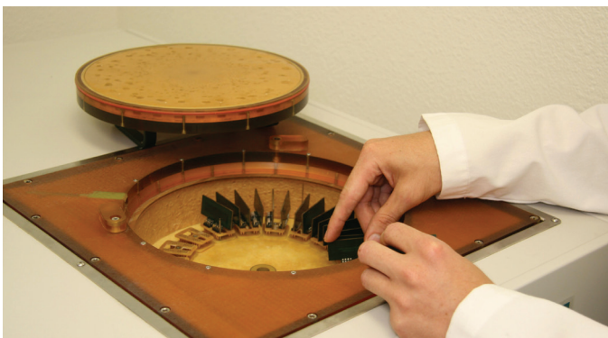
Placing the coupons inside a HATS tester

These differences mean that HATS™ testing technology and cannot be directly compared to other non-dual-chamber thermal shock technologies. HATS™ testers use air as the heat transfer mechanism just like the tried and true method used by dual chamber thermal shock testers for the last 50+ years.