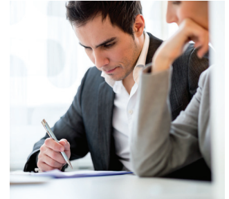
Get NTS involved in the early stages of product development