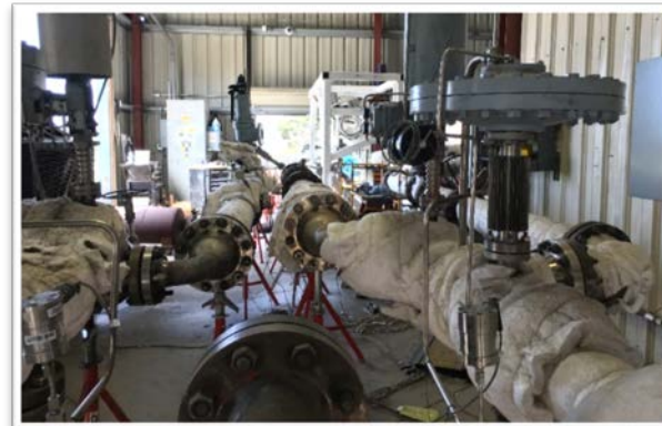
Lifetime endurance testing of large, multi-circuit bleed air heat exchanger