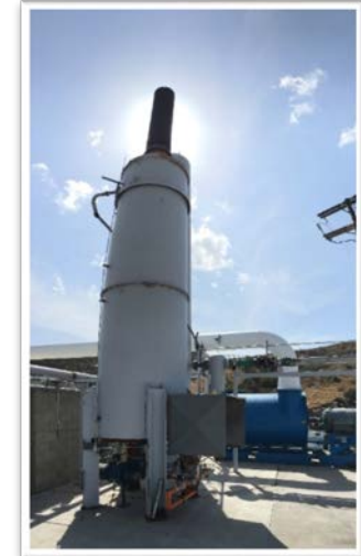
3M btu/hr low-NOX burner