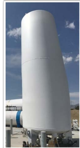
High volume LN2 storage for gas conversion