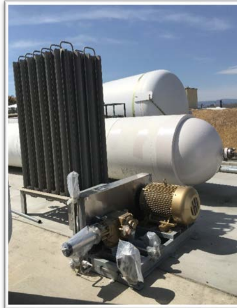
High pressure GN2 and Ghe storage tanks with LN2 pump