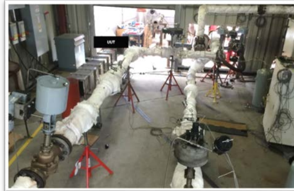
Thermal Endurance Testing of a bleed air heat exchanger