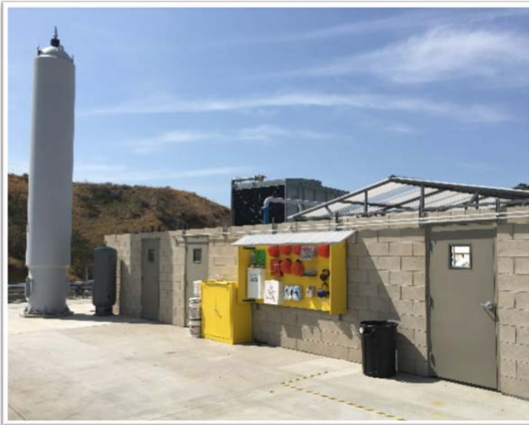
Three high pressure gas test cells