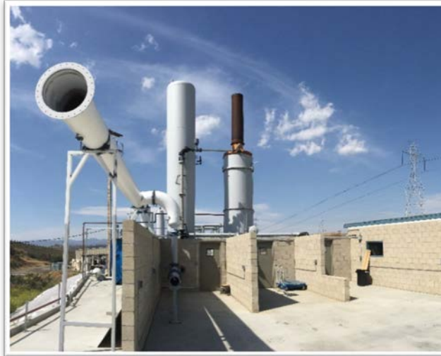
Test cells with air flow drops