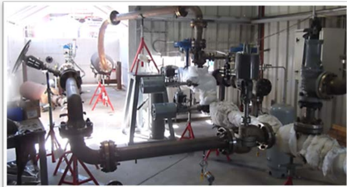
Thermal shock testing of a bleed air/cabin air valve