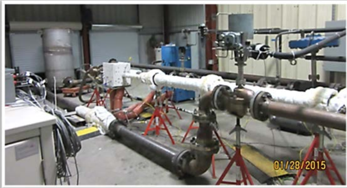
Thermal Endurance Testing of an Anti-Ice Valve with ambient conditioning