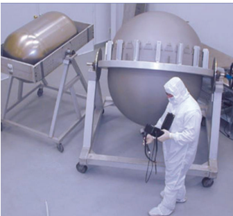
Contamination analysis and leakage tests are critical to space programs